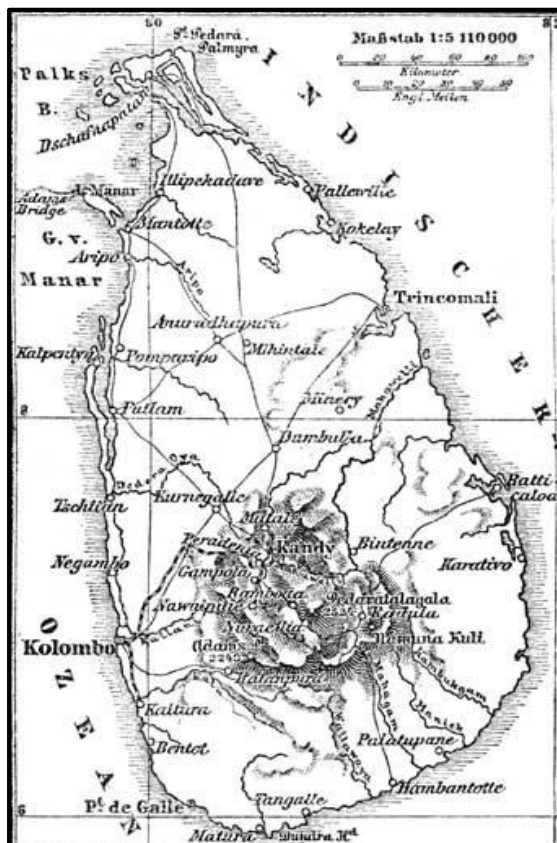
Map 1: Ceylon Map showing Kandyan highlands, the 1900s